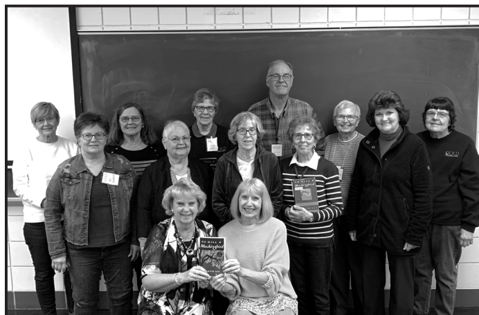
Hybrid delivery allows participants to choose to attend either in person or via Zoom.